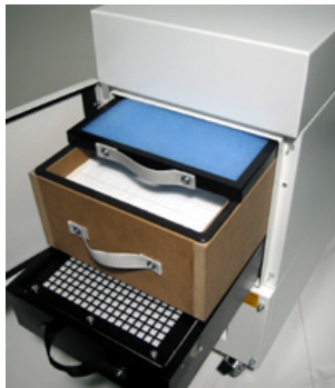
Innovative Filter Configuration

Durable – Manufactured in Germany of powder coated stainless steel.